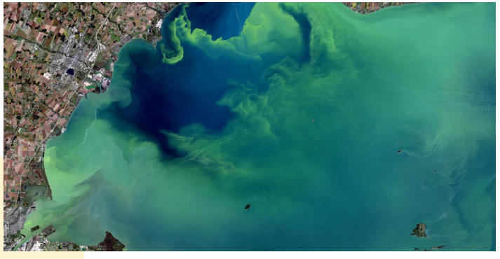
Figure 1. Harmful algal blooms cause thick, green scums that impact water, recreation, businesses and property values.

Certain types of cyanobacteria can produce toxins that are harmful to humans and animals through recreational exposure or through consumption of drinking water. Toxins can also work their way into the aquatic and terrestrial food webs and potentially harm animals and humans. Additionally, algal blooms can lead to hypoxia, or low dissolved oxygen (DO) in the water, either through algal respiration or consumption of oxygen, by decomposers when the algae die off. Persistently low DO can harm sensitive aquatic animals, resulting in chronic stress or even mortality.